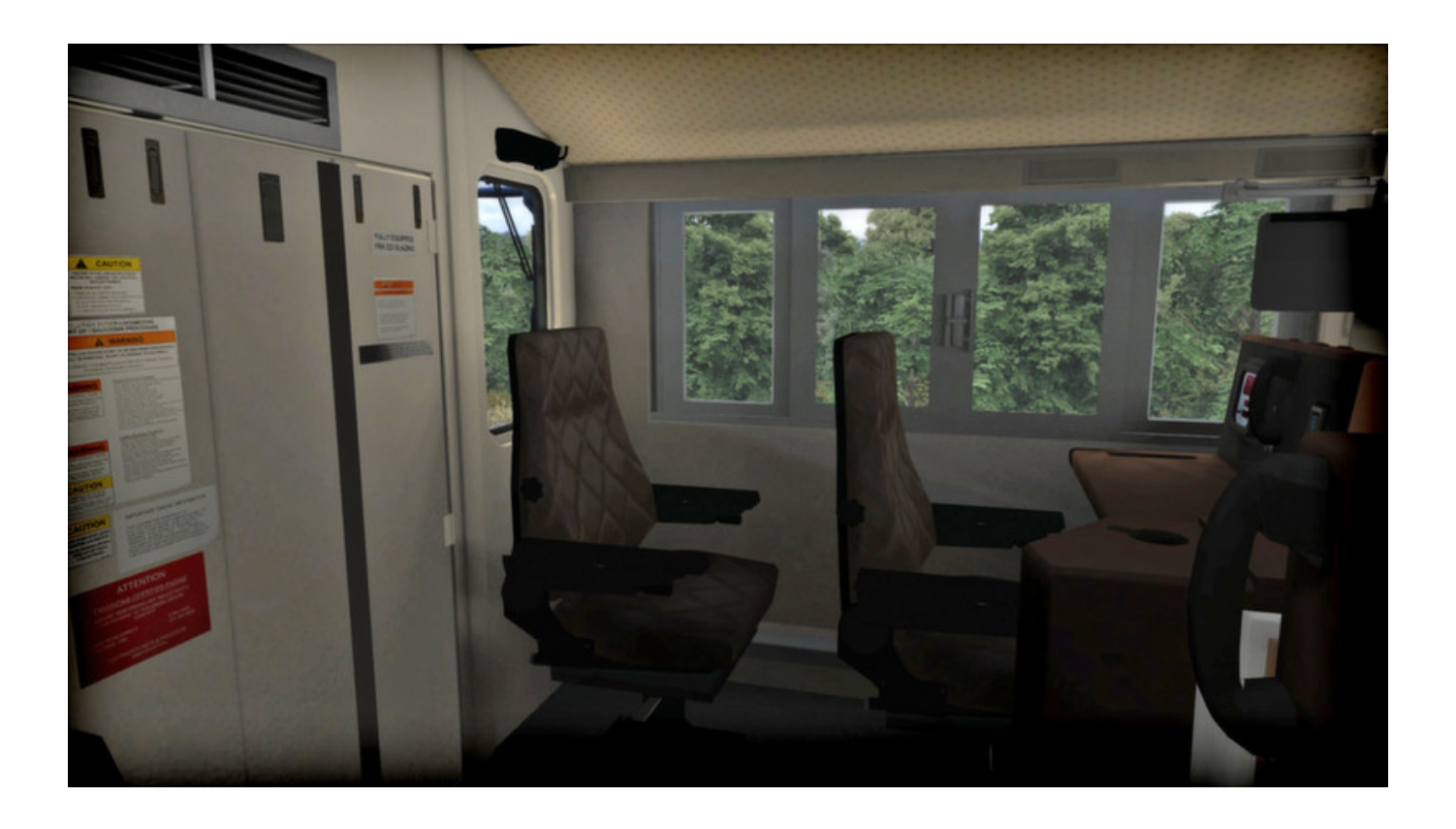
Download ->>->> http://bit.ly/2JmRDfL

Download Train Simulator: CSX SD80MAC Loco Add-On .zip